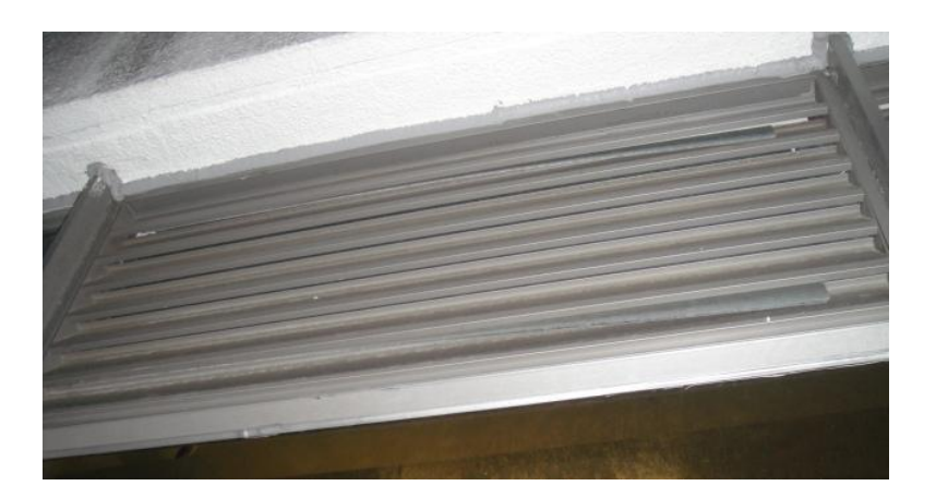
Figure 2. Window openings