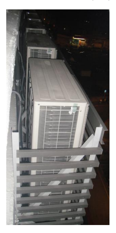
Figure 1. Outdoor unit

On technical side, the air-conditioning system of this office is very simple and there is no question that there are much better designs available on the market. But this office represents many of its kind in Hong Kong and regardless of the technical equipments and design; we focus more on the human behaviour in this study and show the energy saving potential by just changing the behaviour of the office workers. At the end, a proper behaviour is applicable for all kind of buildings regardless their technical facilities.