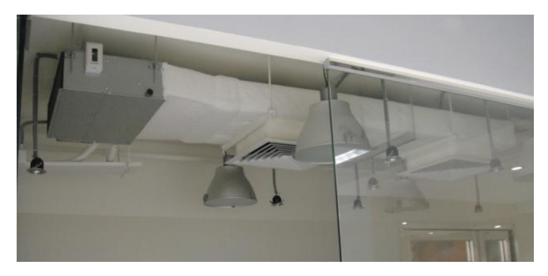
Figure 4. Air-conditioner unit in the meeting room

Covering the floor by tiles instead of a carpet would definitely decrease the bad odours inside the office and would make it easier for the office workers to turn up the air-conditioners.