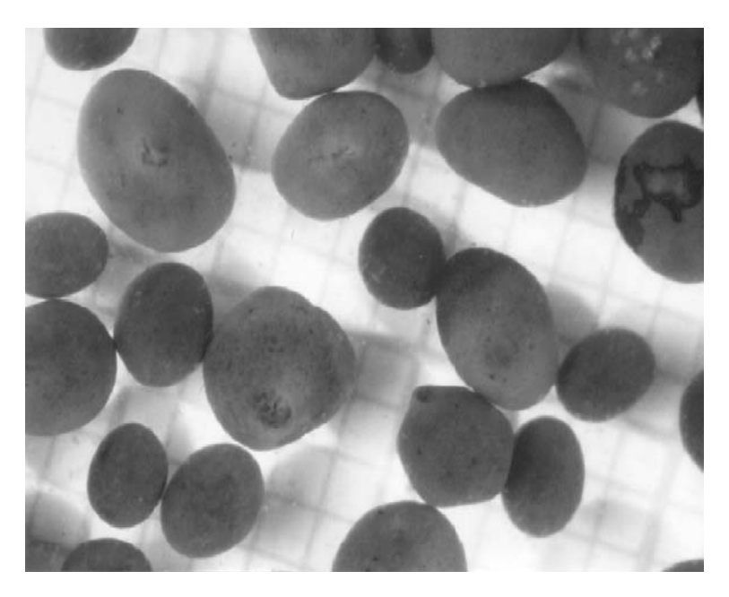
Figure 2. Anaerobic sludge granules from a UASB reactor Hulshoff [7]

sediments, fresh water sediments, septic tank sludge, manure, digested sewage sludge and anaerobic treatment plants [25]. The aerobic activated sludge can be used as seed sludge according to the high content of methanogens where it has estimated by Zeikus, 1979 that each gram of suspended solid contained 10^8 methanogens, while the digested sludge contained 2.5 \times 10^{10} methanogens/g [26]. Various kind of seed sludge have been successfully used for UASB start-up, in addition of the mentioned above, activated sludge was also used as seed sludge which is giving a better performance as well as a shorter start-up period can be obtained. An investigation has been done by to enhance the granulation process by using various kind of precursors, whereby it has been reported that each syntroph-enriched-methanogenic consortia, Methanothix-enriched and Methanosarcina-enriched nuclei, has a positive role on the acceleration of granules formation, whereas using acidogenic flocs was delaying the granules growth [27]. Cations and minerals was essential for the starting phase to granulation, where strong evidences for improvement that are reported in subsequence section of this paper. However, more specifics have to be established to set limited species with seed sludge as a major fraction for anaerobic granulation process.